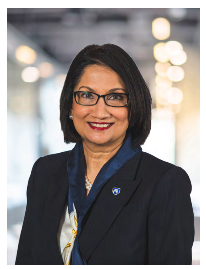
From the President Dear Penn State Community:

Penn State is committed to the safety of our community, the well-being of our community members, and to fostering a secure environment in an open, transparent manner. University Police and Public Safety is a worldclass team that has consistently worked to enhance the safety of all campuses, address issues, and respond to the concerns of our community. The release of this Annual Security Report to our University community provides details of our efforts, procedures and policies. I encourage all Penn Staters to review this report, and to play an active role in the shared responsibility of fostering and maintaining a safe environment for every member of our community. The safety of our students, faculty, staff, and visitors is always Penn State's top priority, and we will continue to strive to enhance security at every level across every campus.