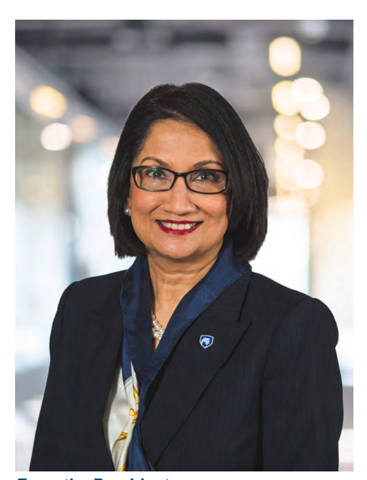
From the President Dear Penn State Community:

Penn State is committed to the safety of our community, the well-being of our community members, and to fostering a secure environment in an open, transparent manner. University Police and Public Safety is a world-class team that has consistently worked to enhance the safety of all campuses, address issues, and respond to the concerns of our community. The release of this Annual Security Report to our University community provides details of our efforts, procedures and policies. I encourage all Penn Staters to review this report, and to play an active role in the shared responsibility of fostering and maintaining a safe environment for every member of our community. The safety of our students, faculty, staff, and visitors is always Penn State's top priority, and we will continue to strive to enhance security at every level across every campus.