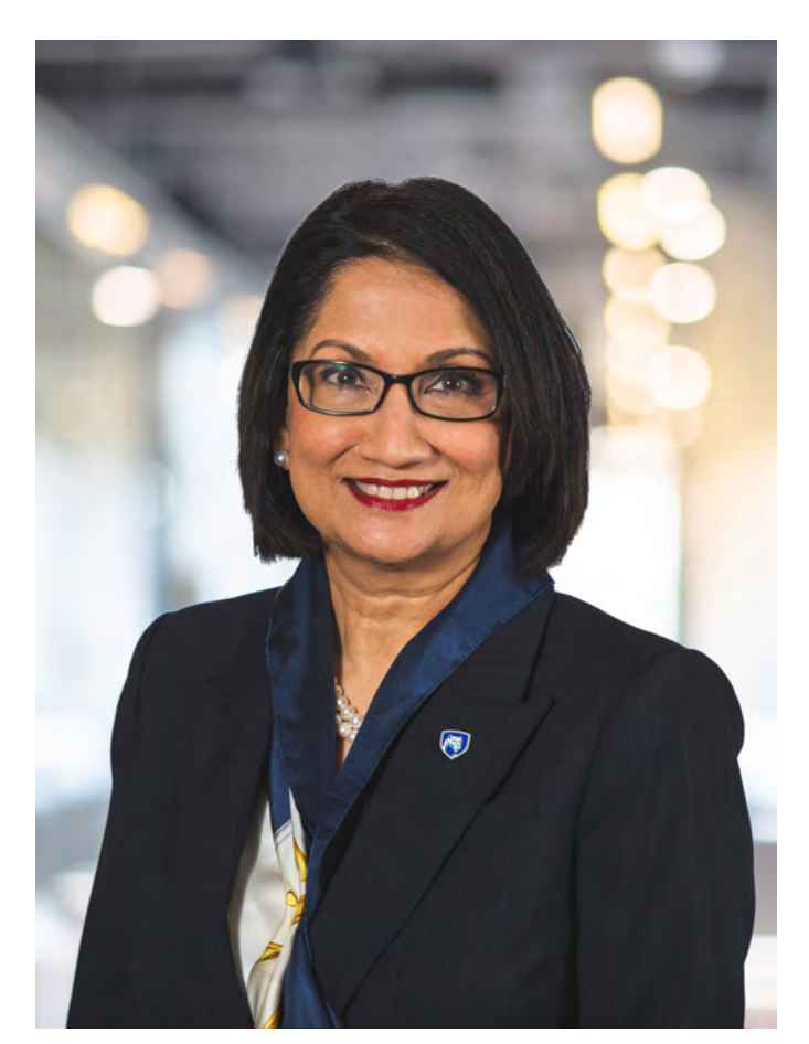
From the President